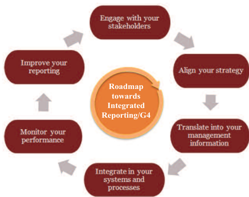
Figure 3. The continuous learning cycle towards good tax governance, step-by-step and focusing on material aspects

What will we learn from following this learning cycle? We do not yet know how we can develop a new common business language from this learning cycle. Yet, working along this learning curve will result in developing that new common business language. In connection with this we refer to the Barley Case in appendix 1 33 .